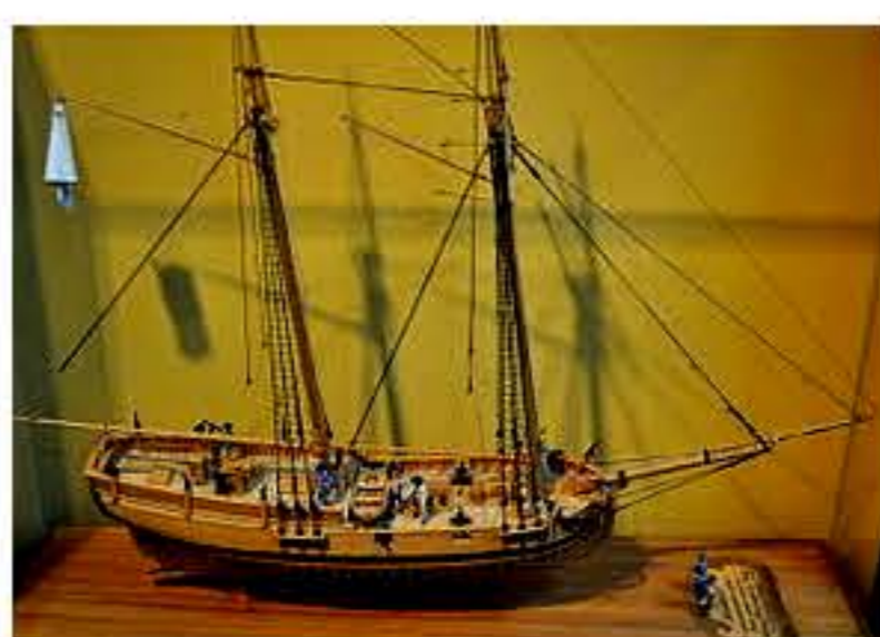
Model of Hannah in the U.S. Navy Museum