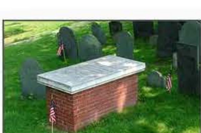
Added by MRS