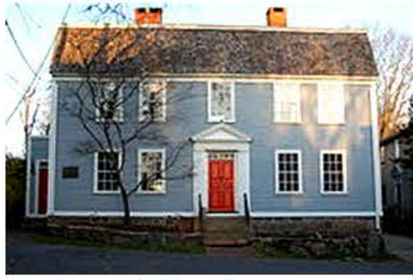
John Glover House