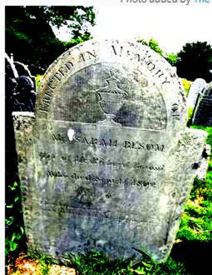
Added by DGB

BIRTH 1732 Marblehead, Essex County, Massachusetts, USA DEATH 17 Sep 1802 (aged 69-70) Marblehead, Essex County, Massachusetts, USA BURIAL Old Burial Hill Cemetery Marblehead, Essex County, Massachusetts, USA MEMORIAL ID 19080259