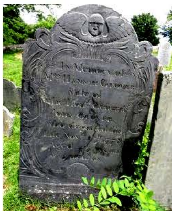
Added by DGB

BIRTH 1733 Marblehead, Essex County, Massachusetts, USA DEATH 13 Nov 1778 (aged 44-45) Marblehead, Essex County, Massachusetts, USA BURIAL Old Burial Hill Cemetery Marblehead, Essex County, Massachusetts, USA MEMORIAL ID 19068929