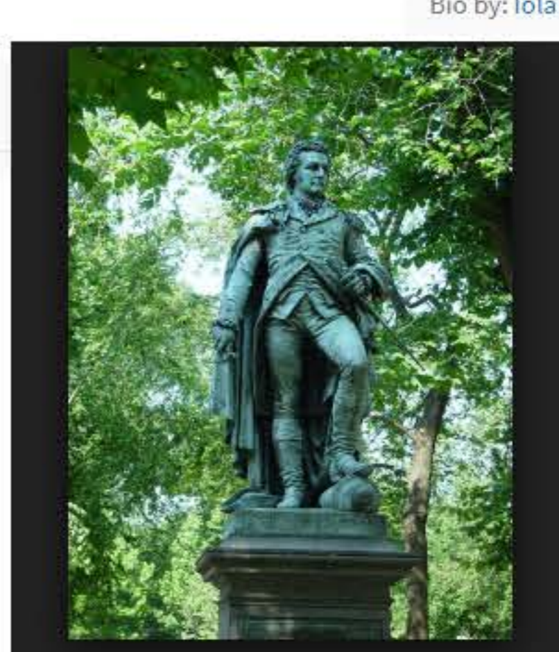
Statue of Glover on Commonwealth Avenue, Boston.

ERECTED WITH FILIAL RESPECT TO The Memory of The Hon. JOHN GLOVER Esq. Brigadier General of the late Continental Army Died January 30th. 1797 Aged 64