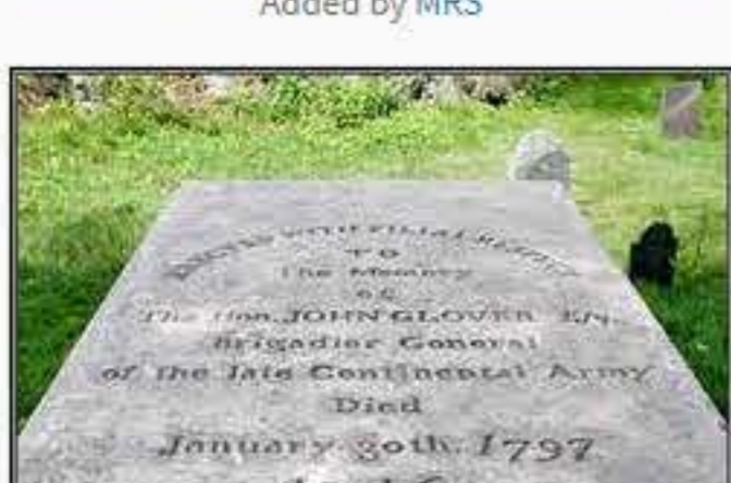
Added by MRS