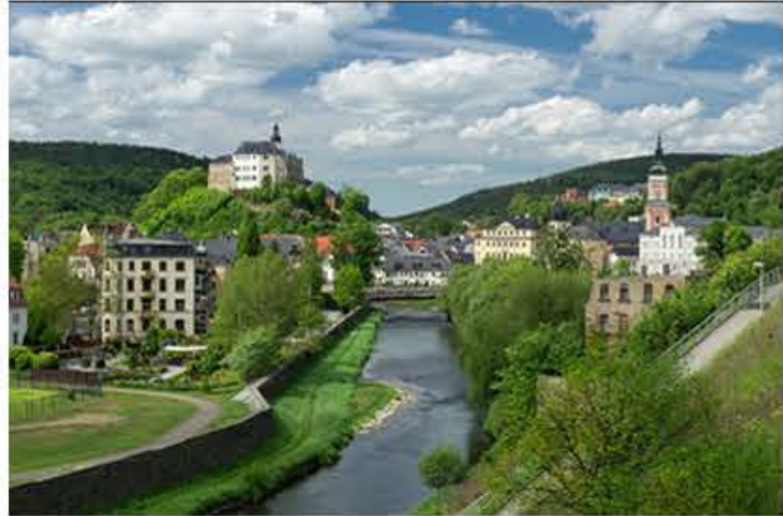
Two Photos of Greiz

Born February 15 th 1862 in Greiz. Died 1955 in Greiz.